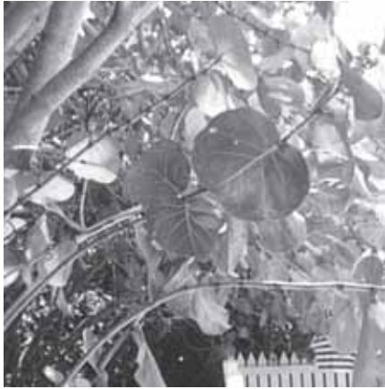
(Sea Grape) Coccoloba uvifera

Those big round leafy trees are called Sea Grape. They are a small spreading evergreen tree that is native to South Florida and can grow up to 30 feet although 15-20 feet is more common.