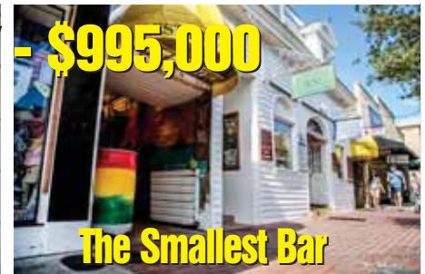
The Smallest Bar

The Old Customs House Inn is a charming island getaway located within walking distance to everything, then the Old Customs House Inn and Guesthouse should be your first choice! Located right on Duval Street. You can walk to get to fishing trips, sunset sails, Mallory Square, Hemingway Home and many other Old Town Key West Attractions.