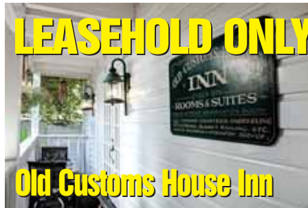
Old Customs House Inn

Every state, county and city and small community has their own set of regulations. Part of your research is to find out what those regulations are and when and if they may change in the near future.